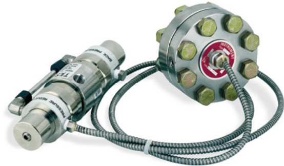
42MW ISOLATOR SHOWN WITH SJS SERIES REGULATOR

Hastelloy® is a registered trademark of Haynes International, Inc.